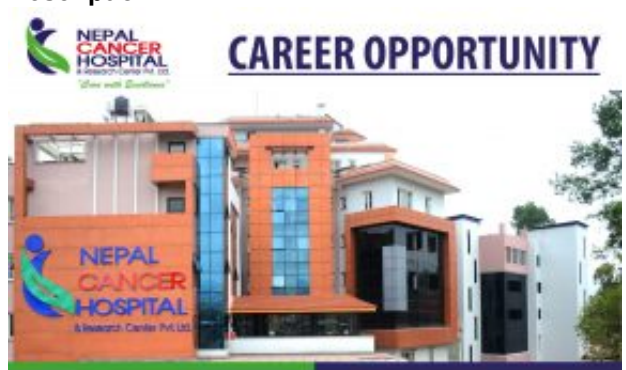
Date of Publication: 22<sup>rd</sup>April, 2021